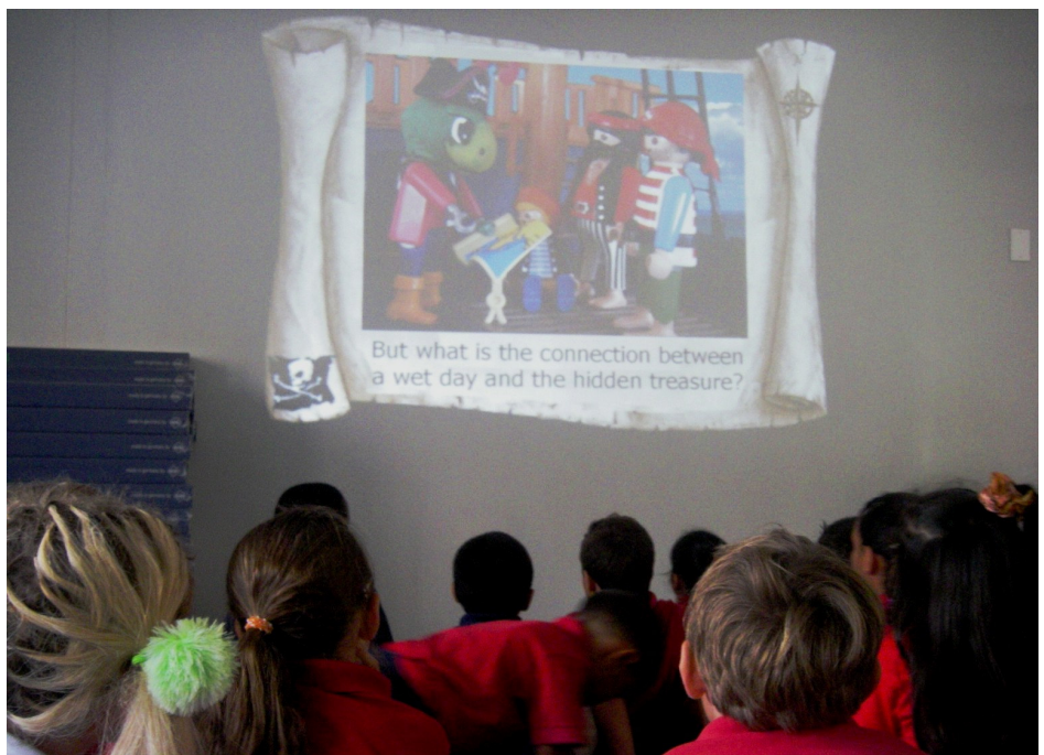
School children watching the adventures of Captain Scout

The new sea turtle nesting season starts on St. Maarten starts in April. We plan to inform residents and hotels in the 7 nesting areas of Dutch St. Maarten about nesting activities in their neighbourhood and how they can help with monitoring and increasing nest and hatching success.